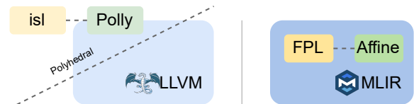
Figure 1. While classical polyhedral compilers have been confined to optional extensions of the compilation flow that interface with external libraries, FPL integrates Presburger arithmetic into MLIR upstream.

As a Presburger library for LLVM/Polly [6], GCC [17], and many other tools, isl grew its mathematical roots